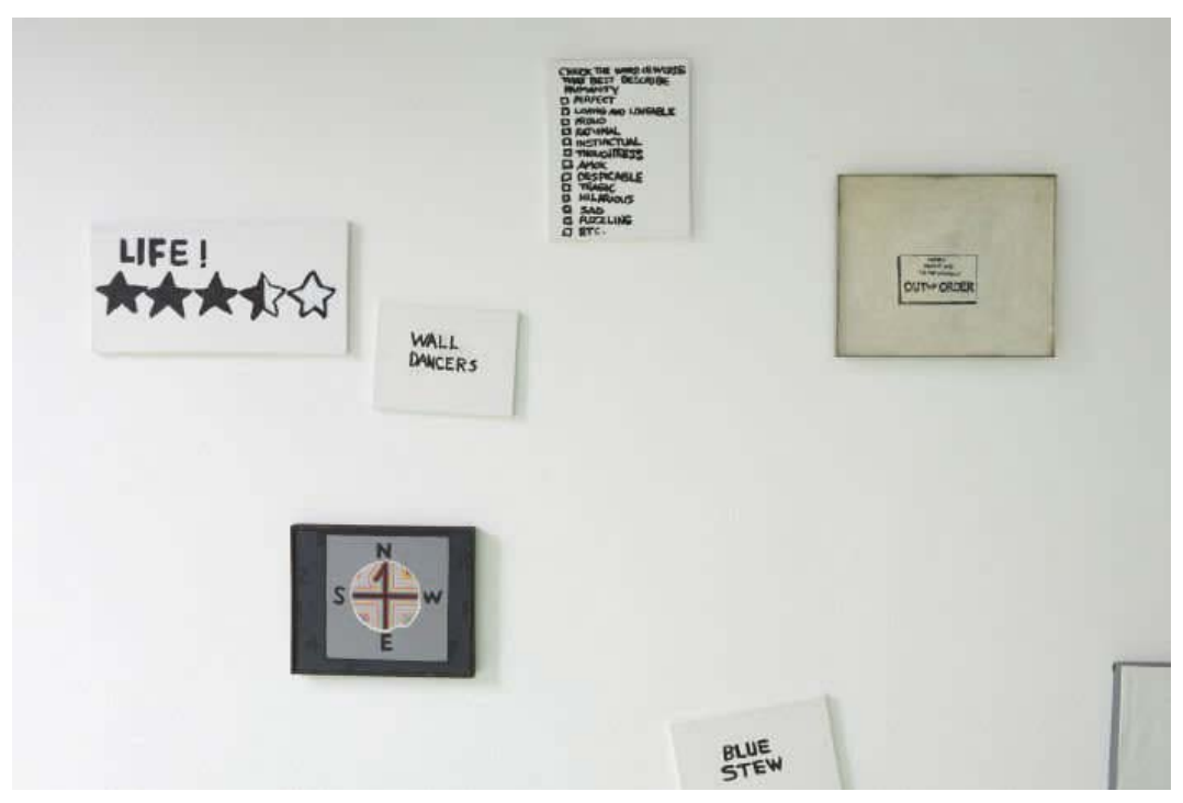
Installation view of Gene Beery's exhibition at Fri Art

It seems the right moment for this work. What may have been out of time in 1960s America looks increasingly relevant today. Beery's recent "Life Stars" (2016), which assigns a 3.5/5 star-rating to "life", poignantly sums up how much of our critical thinking is now reduced to the likes of an online restaurant review.